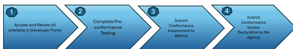
Figure 1 – Connecting systems security conformance process

Table 3 provides a description of vendor actions required for each step of the vendor conformance process. The step numbers correlate to the numbers within the process flow described in Figure 22.