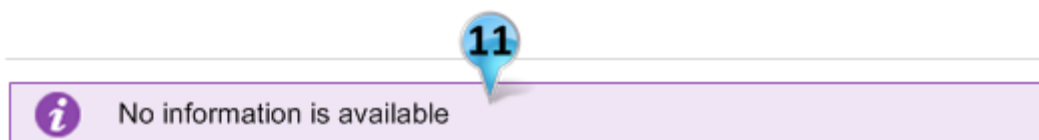
Figure 2: No information is available diagram

A PCEHR that contains no information or a view with restrictive filtering applied may return no results. These conformance points apply in these circumstances.