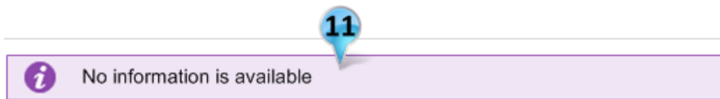
Figure 2: No information is available diagram

A PCEHR that contains no information or a view with restrictive filtering applied may return no results. These conformance points apply in these circumstances.