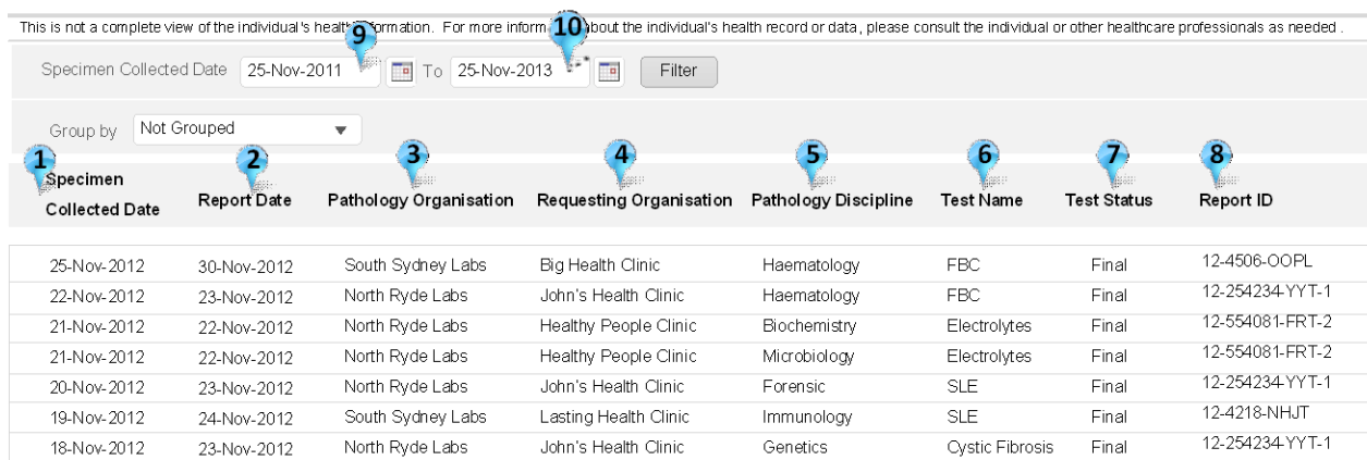
Figure 1: View Content diagram